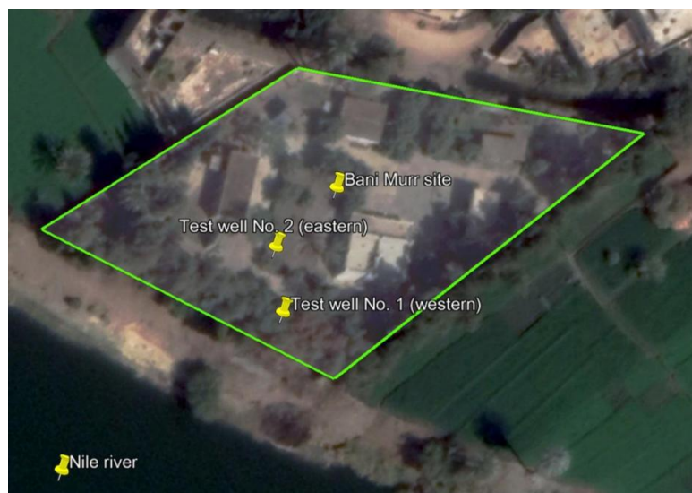
Fig. 1. Location of the study site

The setting and design of an RBF system does not only depend on hydrogeological factors, but also on technical, economical, regulatory, and land-use factors. This site was designed to supply potable water to the construction staff of residents. It consists of 4 productive groundwater wells (L1 , L2 , L3 , L4) ranging from 100 m to 150 m depth located at 100 m apart from the River Nile. There is Iron and manganese treatment unit and disinfection applying chlorine as calcium hypochlorite (Table 1).