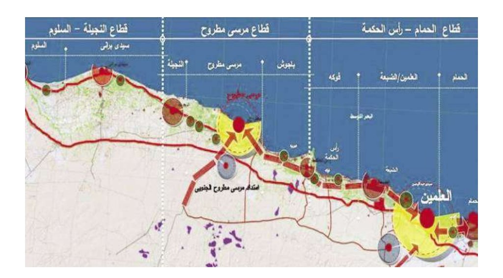
Fig. (1). Map of sampling sites at the Middle Northern Mediterranean coast of Egypt; western coast of Alexandria city, El-Hamaam and Sedi A. Rahman towns.

The studying area extends along the Middle Northern Mediterranean coast of Egypt for about 135 KM. It includes three sampling stations; western coast of Alexandria city, El-Hamaam and Sedi A. Rahman towns as could be seen in Figure (1).